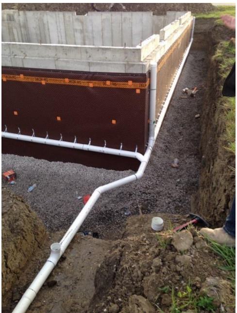
(storm pipes around perimeter of home - underground)

Here are photos of what we inspect for the storm clean-out: