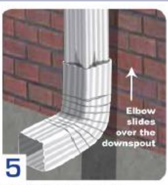
Attach the elbow OVER the downspout to prevent leaking.