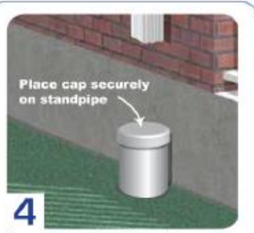
Cap the standpipe where it enters the ground. This prevents any debris, water or small animals from getting into the system and causing a blockage.