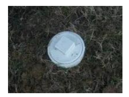
How to locate sanitary clean-out: