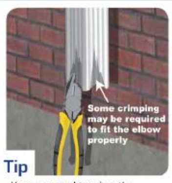
You many need to crimp the downspout with pliers to make it fit inside the elbow.