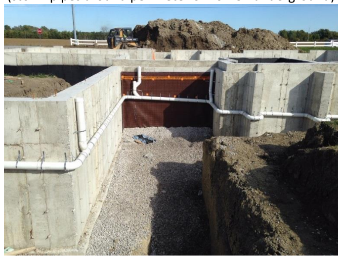
(storm pipes around perimeter of home - underground)