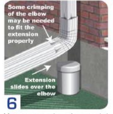
Measure, cut, and attach any needed extensions OVER the elbow to prevent leaking.