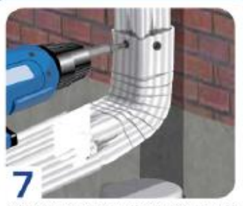
Drill holes and secure the elbows and extensions with sheet metal screws. (self tapping screws have a sharp end so you don't need to pre-drill a hole) One screw on each side is typically enough. (two to four screws)