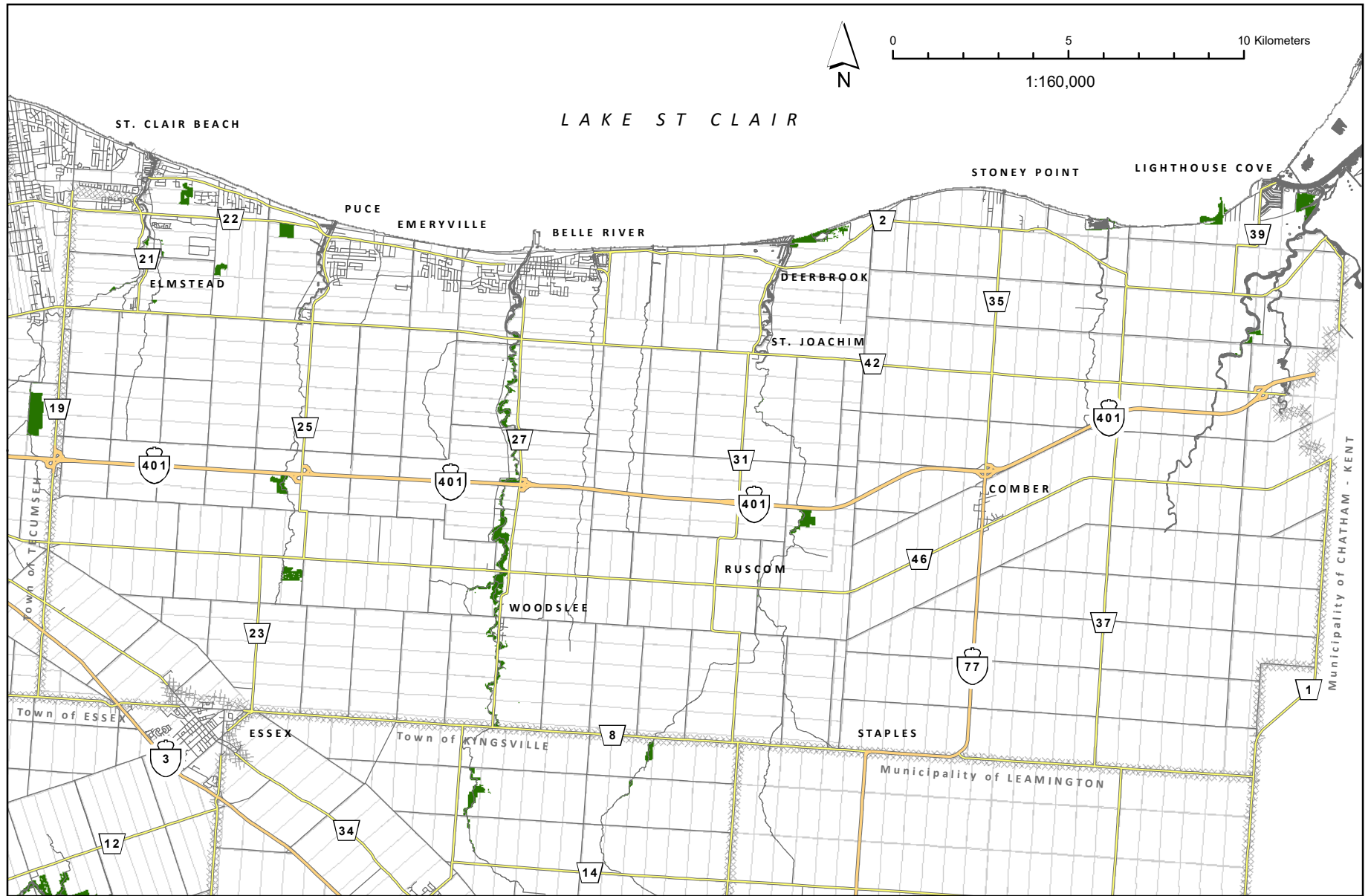
Figure 2: County of Essex Official Plan (2014): Schedule A1 - Land Use Plan